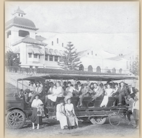
Students arriving on campus in 1915.

The Centennial Committee would like to borrow Citrus College photos and college memorabilia for the Centennial effort. For more information, please contact the Citrus College Foundation, 626-914-8825 or foundation@citruscollege.edu .