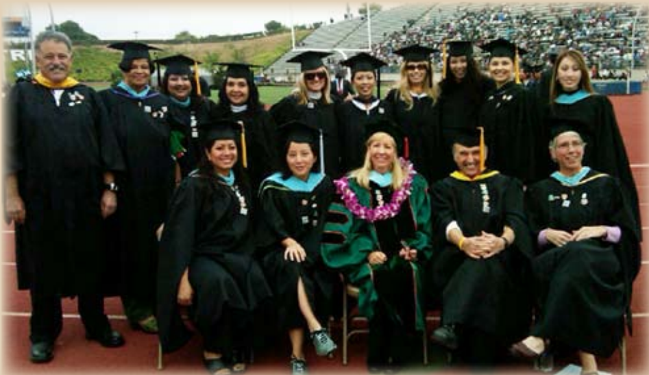
Members of the Citrus College counseling faculty at Commencement.