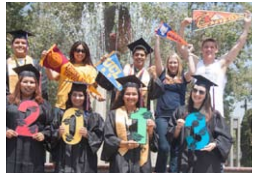
A group of Citrus College students celebrate their transfer to four-year institutions.