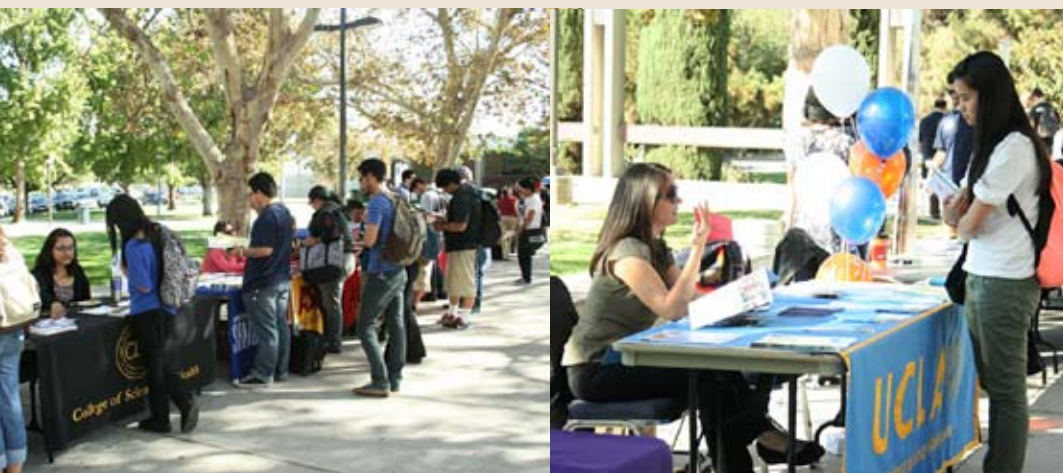
Nearly 60 colleges and universities participated in the 2013 Fall College Fair, allowing students to receive information from college representatives.

Throughout the year, the Career/Transfer Center offers numerous events that enable students to learn more about the transfer process. From the college fairs, featuring representatives from dozens of CSU, UC, and private universities, to the university rep visits that allow students to meet one-on-one with people from their colleges of choice, the center is committed to helping Citrus College students make educated decisions about their academic future.