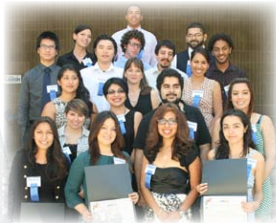
2013 Edison International/STEM College of Completion Scholarship Recipients

"Pursuing a career in STEM will allow me to work in a field that will make the world a better place for generations to come."