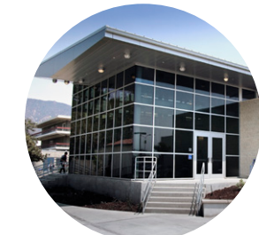
Vocational Technology State of the art automotive training center, State and bond funded