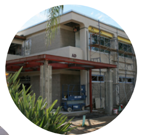
Administration Building Renovation Projected Completion Fall 2013; Construction of East Campus Restroom completed early 2012