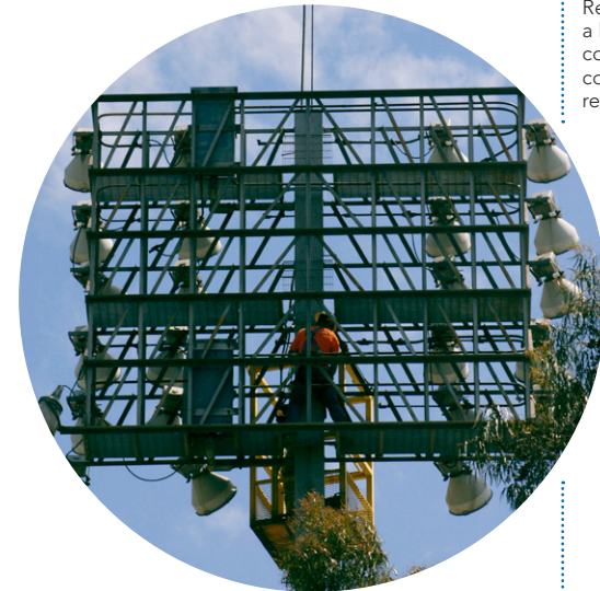
Stadium Lighting California Electrical Contractors' Association Design Award