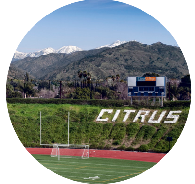
Stadium and Softball Complex Reinvigorating a highly-valued college and community resource