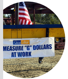
Measure G Approved Citizens Oversight Committee Members Appointed

Annual Citizens Oversight Committee 7th Annual Report to Our Community