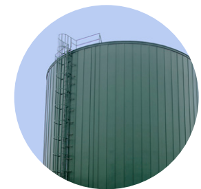
Central Plant State of the art heating and cooling system, Southern California Edison grant received