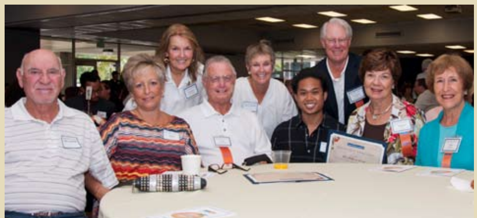
The Foundation's Annual Scholarship Reception awarded over 200 scholarships to transferring and continuing students.