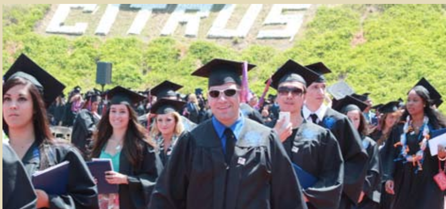
2012 Citrus College graduates