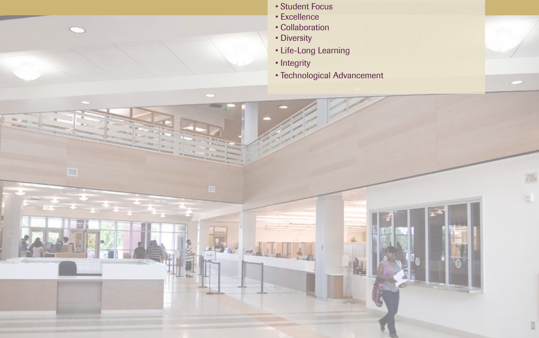
Entrance and interior of the Student Services Building, dedicated fall 2011.