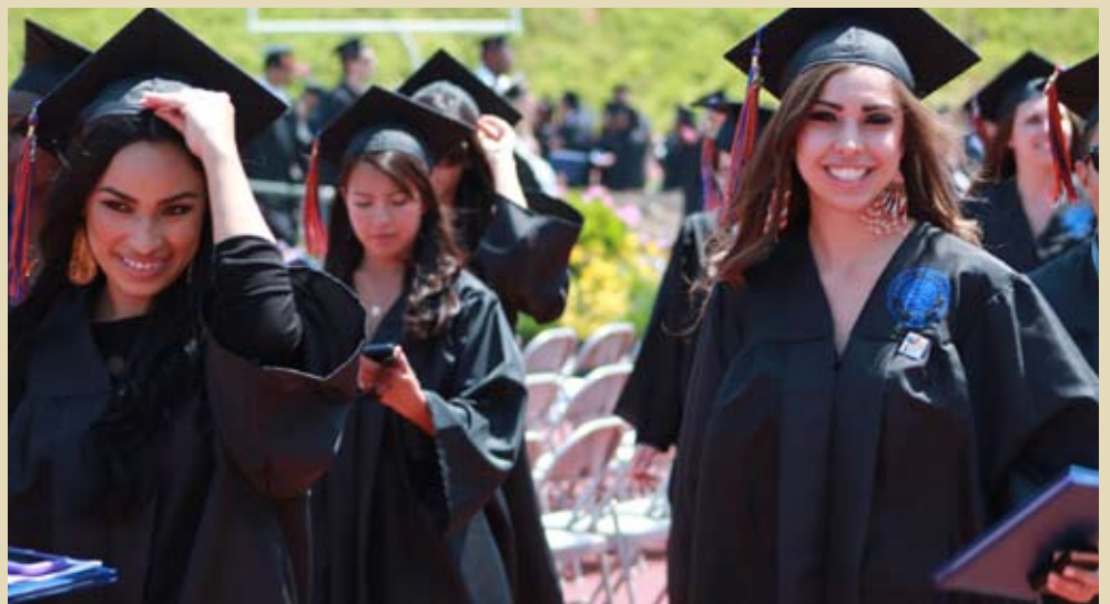
Members of the Class of 2012

At the state level, Citrus College ranked above its California community college peer groups in all of the indicators presented in the Accountability Reporting for Community Colleges (ARCC), a report presented to the California State Legislature every year. These accountability indicators are comprised of seven benchmarks that reflect student progress completion or achievement in the Degree, Certificate and Transfer; Occupational and Workforce Development; and Basic Skills, English as a Second Language, and Enhanced Noncredit categories.