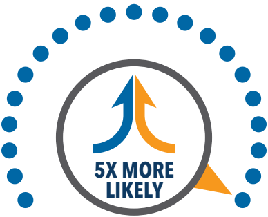
COMPLETING TRANSFER-LEVEL MATH AND ENGLISH