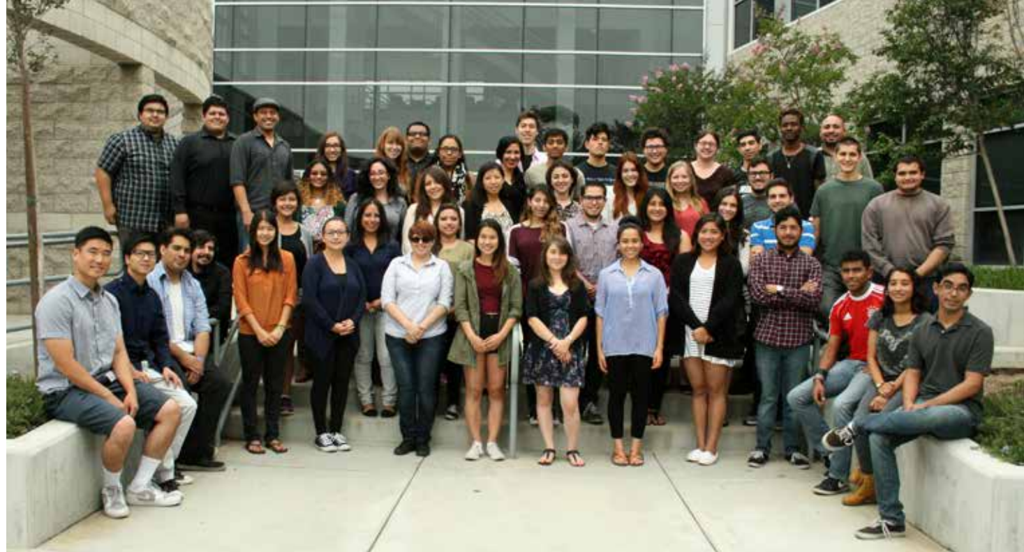
Fifty-one Citrus College students participated in the STEM program's SRE in 2015. The college was awarded the Chancellor's Student Success Award because of this innovative program.