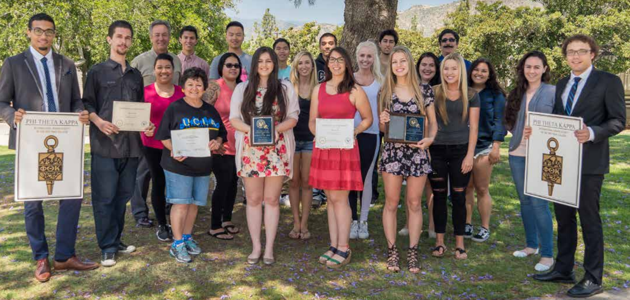
The Beta Nu Eta chapter of the PTK honor society was recognized as one of the top 100 chapters in the nation, among other honors, in the spring of 2016.