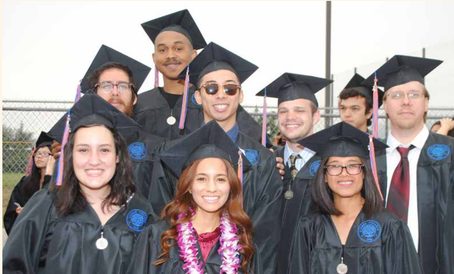
The Citrus College class of 2016 consisted of 1,425 graduates, the highest number in institutional history.