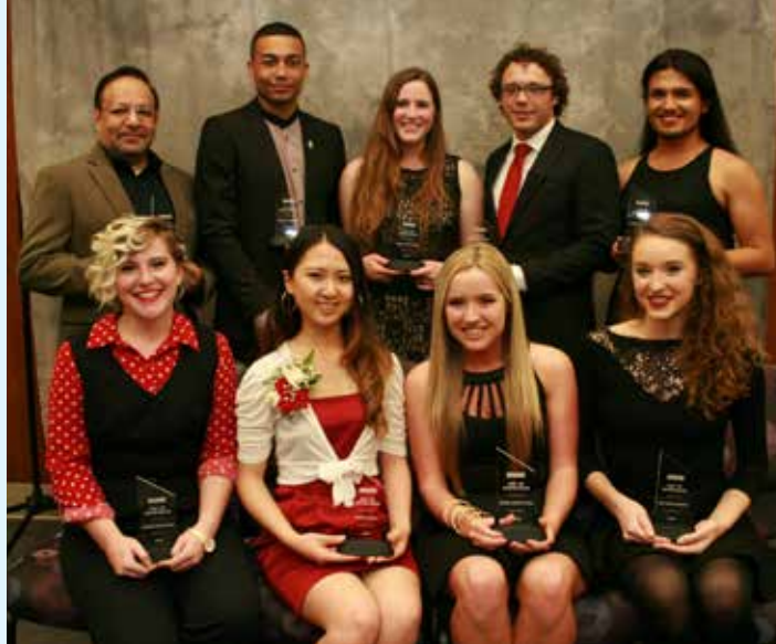
The Key of Knowledge recipients achieved the college's highest academic performances.