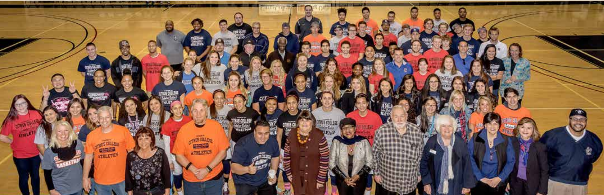
A record number of student athletes were recognized as Scholar Ballers during the 2015-2016 academic year.