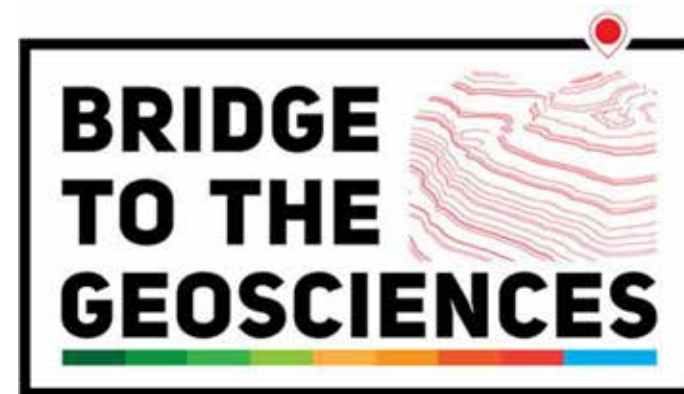
The three-year Bridge to the Geosciences project is funded by a grant from the National Science Foundation, awarded in December 2015. The project is designed to give Citrus College students an opportunity to explore the possibilities the geosciences hold for all STEM majors.

For the first time in institutional history, Citrus College was awarded a grant from the National Science Foundation. The $406,321 award was used to fund GP-EXTRA: Bridge to Geosciences for Community College Students. This collaborative project was designed to increase the number of STEM students exposed to career opportunities within the geosciences. As part of the project, students participated in experiential learning “geomodules” organized around four different subfields of the geosciences: planetary, atmospheric, oceanic and environmental sciences. These geomodules included research activities with scientists at the Oak Crest Institute of Science in Monrovia, the Jet Propulsion Laboratory in Pasadena, the Center for Dark Energy Biosphere Investigations on Catalina Island, and the University Corporation for Atmospheric Research in Boulder, Colorado. The project will engage 20 students annually from 2016 through 2019.