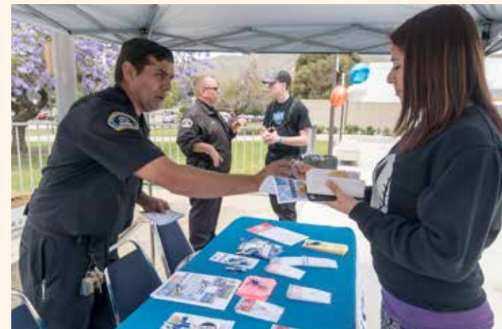
Officers from the Citrus College Department of Campus Safety and the Glendora Police Department answered student questions during the Coffee with a Cop event in April 2016.

The Citrus College Department of Campus Safety, in partnership with the Glendora Police Department (GPD), hosted Coffee with a Cop in April 2016. During this two-hour event, students, employees and community members had the opportunity to voice concerns and ask questions of Campus Safety and GPD officers. Attendees were given complimentary coffee, pastries, key chains that featured safety whistles and LED flashlights. The purpose of Coffee with a Cop is to build public confidence and engage in meaningful discussions regarding issues critical to campus safety.