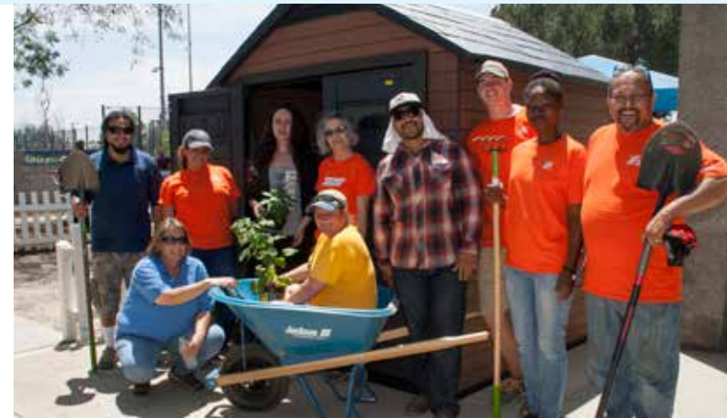
Approximately 30 volunteers from the Citrus College VSC and The Home Depot created a garden next to the center.

A sustainable, edible garden made possible by a $5,000 grant from The Home Depot Foundation was created outside the Citrus College Veterans Success Center (VSC) in May 2016. A team of approximately 30 volunteers, representing both the VSC and The Home Depot, planted the garden in a fenced-in space adjacent to the center. The purpose of the Community Impact Grant, which was one of 22,000 awarded by The Home Depot Foundation in 2016, is to help students stretch their food budget dollars, make healthy choices and experience the therapeutic benefits of gardening. Student veterans now use the area to grow a variety of fruit and vegetables, including corn, onions, squash and blueberries. To aid in the garden's upkeep, The Home Depot Foundation also gifted Citrus College additional gardening supplies that will enable students to care for the garden for years to come.