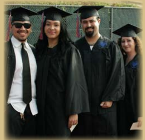
2014 Citrus College Graduates