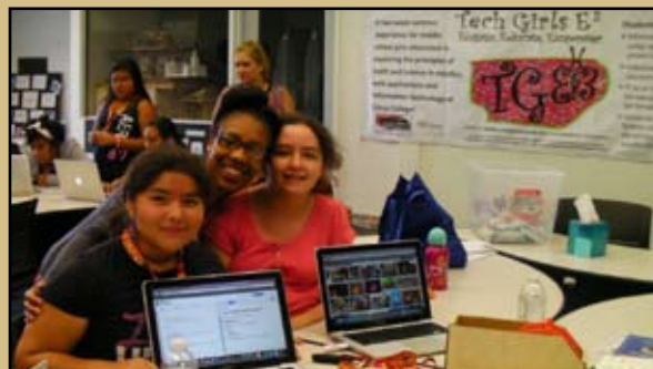
Web page creation was one of many skills taught at TGE3 during the summer of 2014.

These summer programs are instrumental in fostering a college-going culture among local K-12 students, while raising awareness of Citrus College's programs and services in the communities it serves.