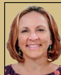
May 2014 Sarah Bosler Library