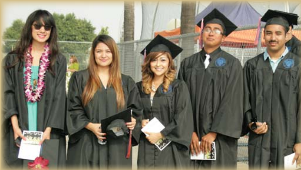
Citrus College celebrated its 98th Commencement on June 14, 2014. More than 2,100 degrees were conferred, an all-time record for the fourth consecutive year.

Citrus College ended the 2013-2014 academic year on a celebratory and record-breaking note. During the 98th Commencement in June, the college conferred an unprecedented 2,119 associate degrees, breaking its record for the fourth consecutive year. In addition, 442 Associate Degrees for Transfer (AD-T) were awarded, securing the college's position among the top three California community colleges granting AD-T's, and first place in the state for conferring nearly 400 Associate in Science Degrees for Transfer.