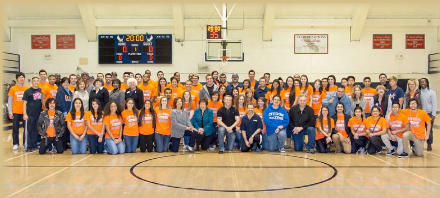
Student athletes who received Scholar-Baller honors are pictured with Citrus College board members, faculty, and staff during the college's annual Scholar-Baller night.