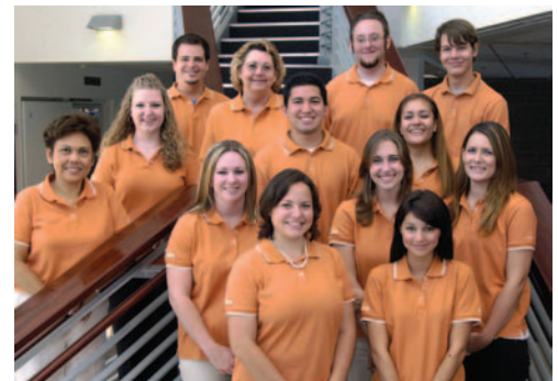
Student Ambassadors provide peer to peer influence

Events designed to showcase the campus and its programs are held annually: the High School Counselors' Breakfast; Parent Orientation Night; Preview Days, a two-day event where students visit the campus to learn about the various academic and career education programs, including fine and performing arts; and Early Decision Days, where high school seniors come to the campus for orientation, enrollment, and assessment.