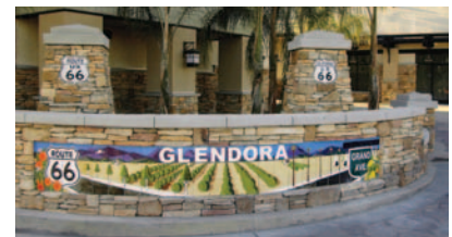
Bill Bird Local Developer

“We selected Citrus College in our continuing interest in supporting the college, as we believe it provides a valuable asset to the community.”