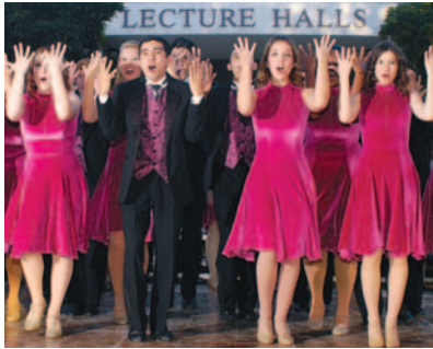
A scene from the 10th annual A Taste of Autumn