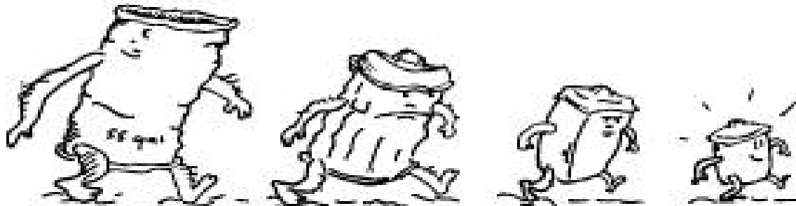
The Evolution of the waste can