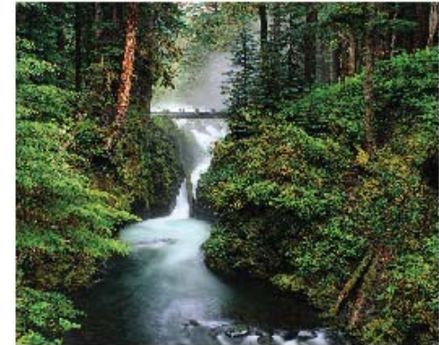
GREEN: Renewable energy and sustainable resources.

The group has support from Vocational Technical Education Act (VTEA) funding and will concentrate its efforts in two