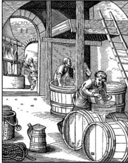
A 16th century brewery

Adapted from Alcohol and Academics , Academic Skills Center, Dartmouth College, 2001 and http://www.alcohol.vt.edu/Students/academicSuccess.htm