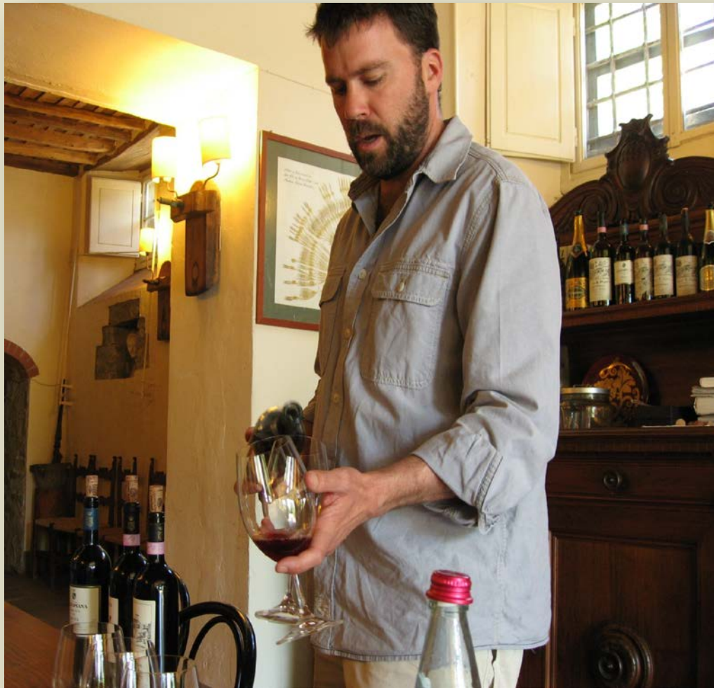
Chianti wine tasting