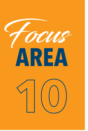
Image Citrus College will be known as a premier community college and will maintain prominence as a leader in higher education and career preparation