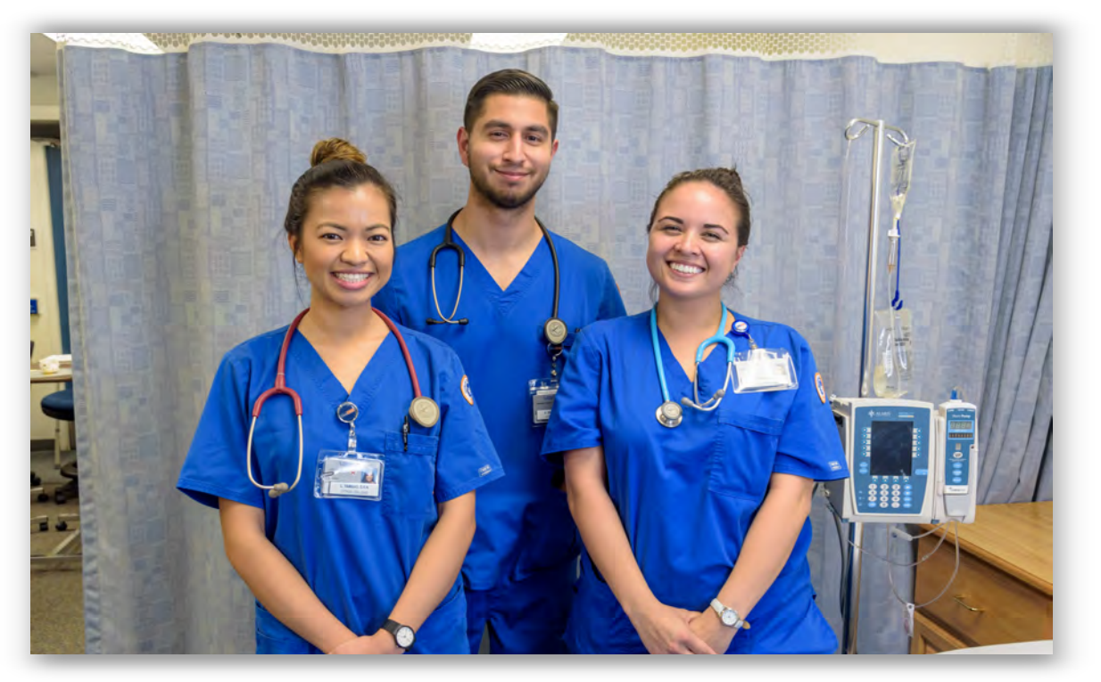
Personal Care Aides and Physician Assistants. See Table 1.1 on page 2.