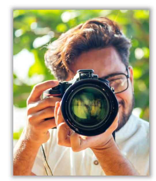
Photographers is the third-highest fastest growing occupation in the Santa Ana-Anaheim-Irvine Metropolitan Division. See Table 1.2 above.