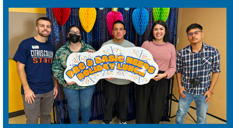
The Citrus College Basic Needs program and Dream Resource Center held a special holiday celebration on Nov. 21

A crackling yule log video, lively music and gift bags filled with treats created a festive atmosphere when the Citrus College Basic Needs program joined forces with the Dream Resource Center to host their annual holiday lunch last month.