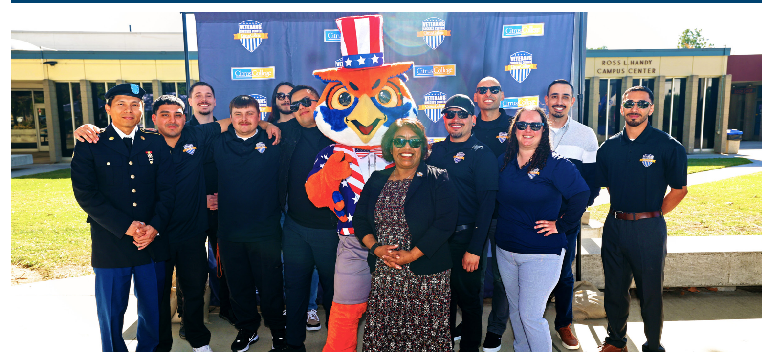
Citrus College Veterans Success Center staff pose for a photo with Hootie following the conclusion of the event

On Nov. 7, Citrus College and Azusa Pacific University (APU) came together to honor local military heroes during the 19th annual Saluting Our Veterans ceremony.