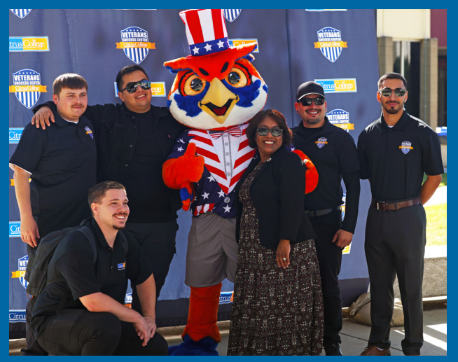
The support provided to student-veterans at Citrus College has once again received national recognition

Military Times, an independent news source for service members and their families, recently recognized Citrus College as one of the nation's top community colleges for veterans and members of the military.