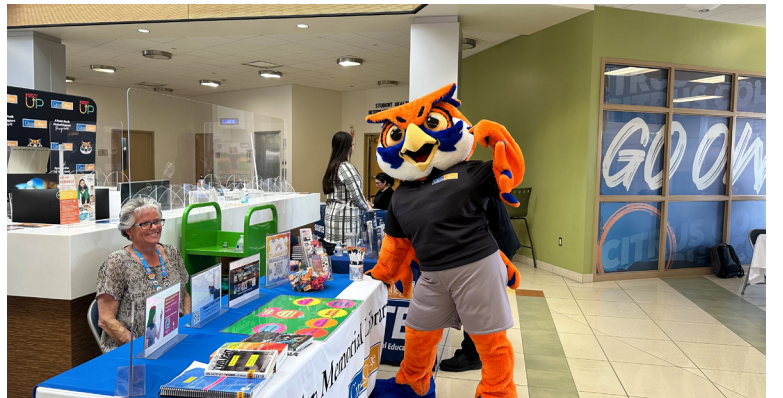
College Information Night

Several hundred local high school students and their parents, family members and friends attended College Information Night on April 24. Hosted by school relations and outreach, the event provided information about academic programs, student services, the enrollment process and more to prospective students.