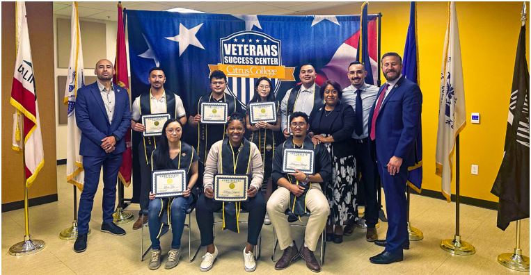
Veterans Recognition Dinner

The annual ASCC/ICC End of Year Dinner celebration took place in the Campus Center on May 13. During the event, the college honored graduating Associated Students of Citrus College and Inter-Club Council officers and student leaders, as well as our outstanding student clubs.