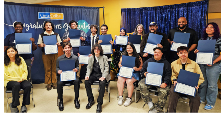
ASCC/ICC End of Year Dinner

Several hundred local high school students and their parents, family members and friends attended College Information Night on April 24. Hosted by school relations and outreach, the event provided information about academic programs, student services, the enrollment process and more to prospective students.