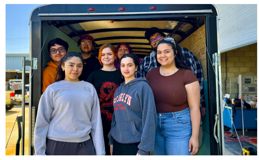
Architecture and engineering students are nearly finished building the second Shower of Grace.

Two years after the first Shower of Grace was built, Citrus College students have nearly finished constructing a second solar-powered shower that will help even more unhoused communities in Southern California.