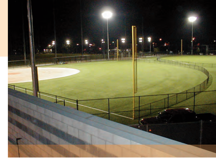
Daytime/Nighttime view of newly completed Softball Field Complex.