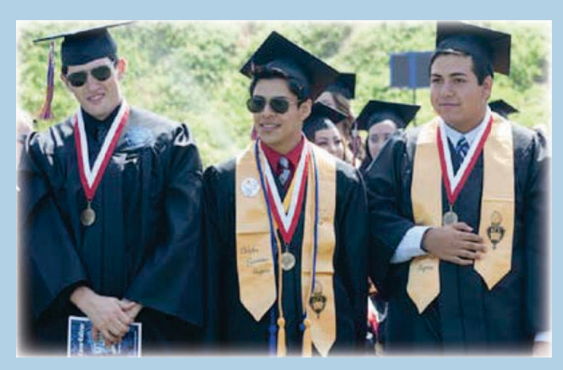
"We ask our fellow students to take responsibility for their education and to remember that their success depends on their choices and actions."

The college ended the academic year having accomplished several projects designed to increase the number of Citrus College students that will earn an associate degree, receive career and technical certificates, and transfer to four-year institutions. Faculty and staff reviewed research data and brainstormed new strategies for delivering academic and student services. Students, the primary stakeholders in the initiative, continued to champion the completion agenda collegewide by sharing the informational resources that will ensure successful completion outcomes.