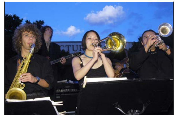
Citrus College Jazz Ensemble