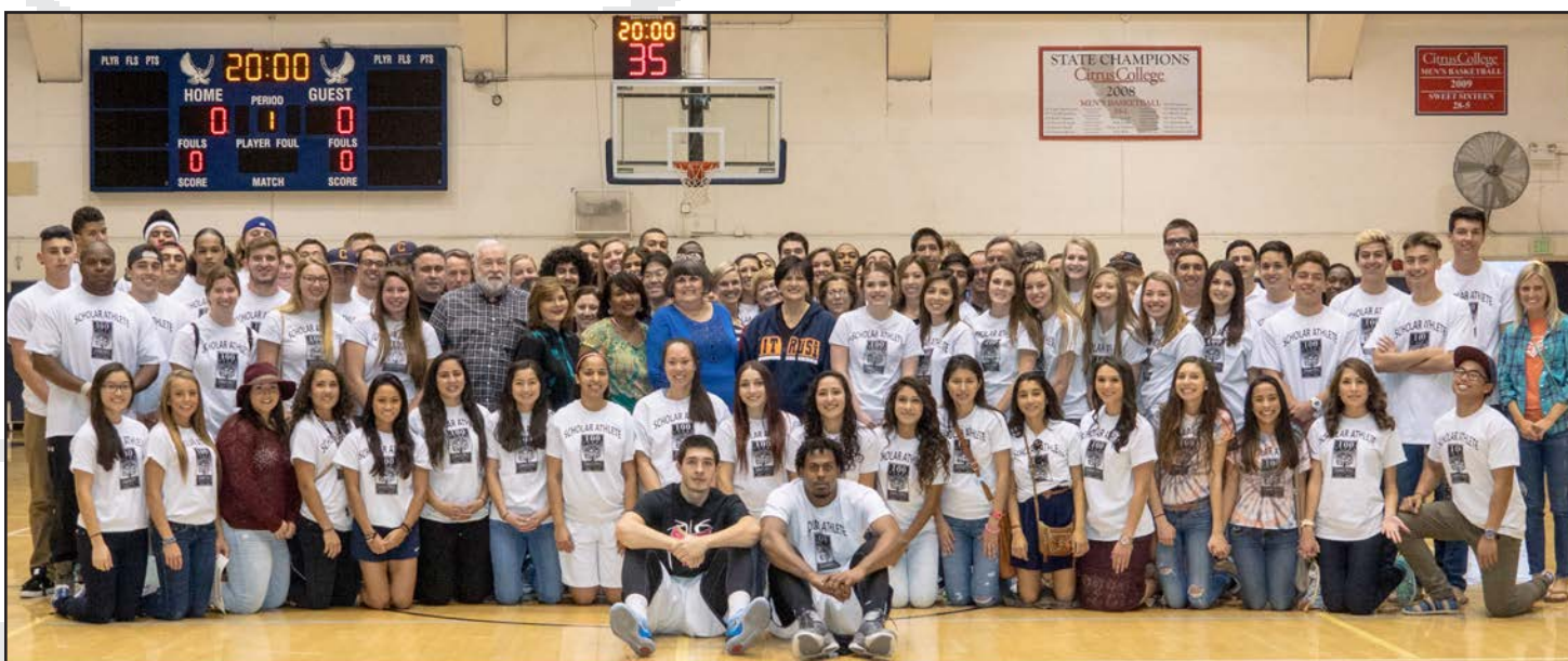
Citrus College's 2015 "Scholar Ballers" and well-wishers

The Fighting Owls' successes are not limited to the pool, courts, and playing fields. In 2006, the Athletics Program introduced Scholar Baller®, a national program that recognizes student athletes who maintain a minimum 3.0 GPA. The number of students qualifying for the program has increased every year, including a record 114 Scholar Ballers during the 2014-2015 academic year. In addition, during the 2014-2015 academic year, 60 percent of sophomore athletes matriculated to a four-year college or university.